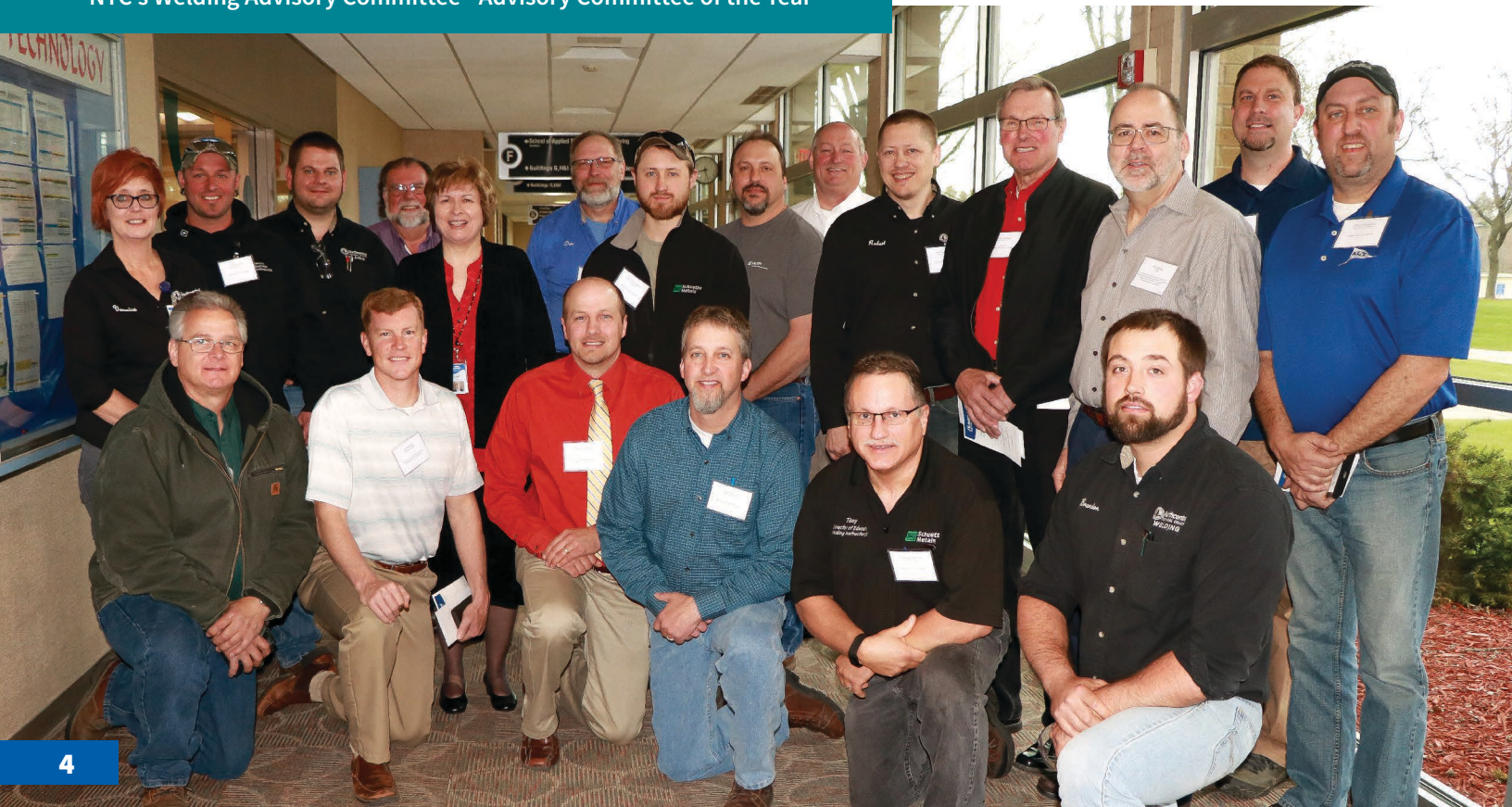
NTC's Welding Advisory Committee - Advisory Committee of the Year

The Employer of the Year award honors one employer whose efforts resulted in an extraordinary impact on NTC, and its students, as well as in the community in which the employer operates. The 2017 recipient of the Employer of the