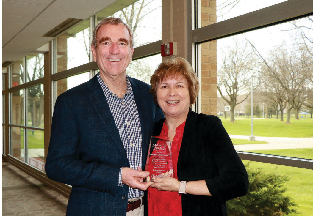
The Greenheck Group - Employer of the Year

Year award was Greenheck. The Greenheck Group's participation on advisory committees is tremendous with 16 employees serving on eight advisory committees throughout the College. Greenheck has a longstanding partnership with the College through the support of equipment, student scholarships and sponsorship of key events and initiatives. They were recognized with the Association of American Community Colleges Award of Excellence for Outstanding College-Corporate Partnerships in 2015 for their partnership with NTC.