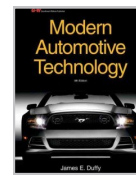
Modern Automotive Technology